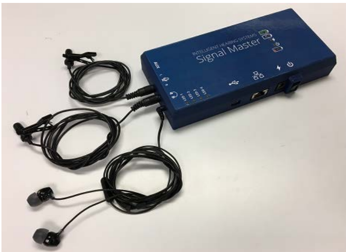
Photo of SignalMaster device showing dual microphones and stereo headphones connected to the system. The system can use any standard 8-12 ohm headphones.